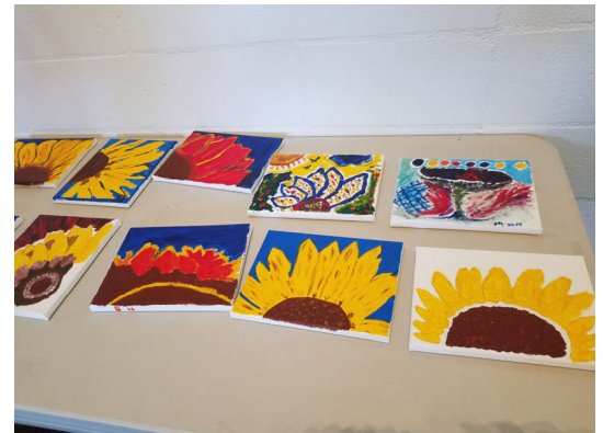
Artwork created by retreat participants during a painting workshop.